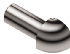
out corner 90°