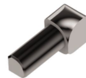
in corner 90°